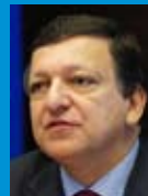
José Manuel Barroso European Commission President