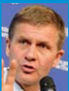
Erik Solheim Norwegian Minister for the Environment and International Development