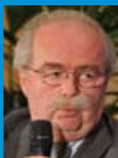
Christophe de Margerie Chief Executive Officer of Total