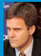
Helge Lund CEO of StatoilHydro

For more information on Friends of Europe , please go to www.friendsofeurope.org