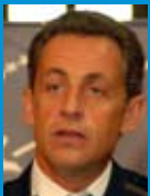
Nicolas Sarkozy French President

Recent contributors to Friends of Europe's activities include: