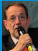
Javier Solana EU Representative for CFSP