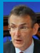
Andris Piebalgs EU Commissioner for Energy