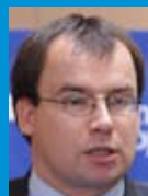
Gareth Thomas MP Parliamentary Under Secretary of State for the UK's Department for International Development (DFID)