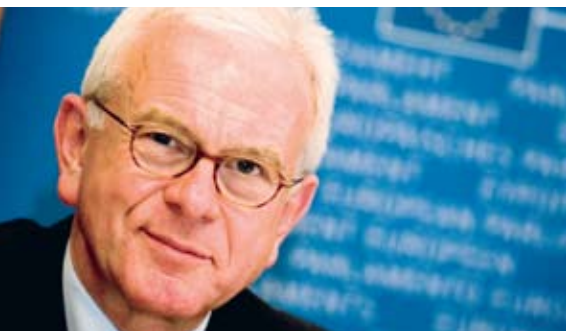
Hans-Gert Pöttering , a politician from the German CDU, is the President of the European Parliament

But, greater efficiencies in the use of fossil fuels and mandated global warming gas reductions, by themselves, are not enough to address the unprecedented crisis of global warming and global peak oil and gas production. The G8 nations have already agreed that overall global emissions of greenhouse gases will need to be cut by 50 percent by 2050, which will require that the industrial nations cut their emissions by 80 to 90 percent. Looking to the future, every government will need to explore new energy paths and establish new economic models with the goal of reducing global warming emissions. The industrial nations will need to achieve as close to zero carbon emissions as possible.