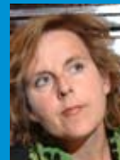
Connie Hedegaard Danish Minister for EU