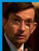
Jeroen van der Veer CEO, Royal Dutch Shell plc