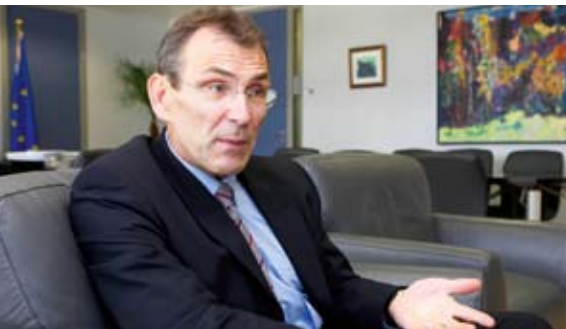
Andris Piebalgs is European Commissioner for Energy

We will need to educate our children to think as global citizens and prepare them for the historic transition from 20th century conventional geopolitics to 21st century global biosphere politics. Education will increasingly focus on both global responsibility to