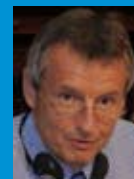
Martin Bartenstein Austrian Ministry of the Economy