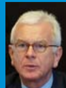
Hans-Gert Pöttering European Parliament President