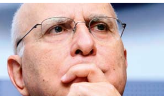
Stavros Dimas is European Commissioner for the Environment

In 2008, Daimler and RWE, Germany's second largest power company, launched a project in Berlin to establish recharging points for electric Smart and Mercedes cars around the German capital. Renault-Nissan is readying a similar plan to provide a network of hundreds of thousands of battery charging points in Israel, Denmark and Portugal. The distributed electric power charging stations will be used to service Renault's all electric Mégane car. Toyota has joined